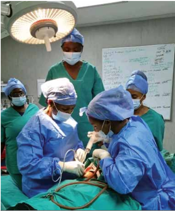
Volunteering Department of Health specialists busy performing operations at Philadelphia Hospital during the Rural Health Matters Outreach Programme.