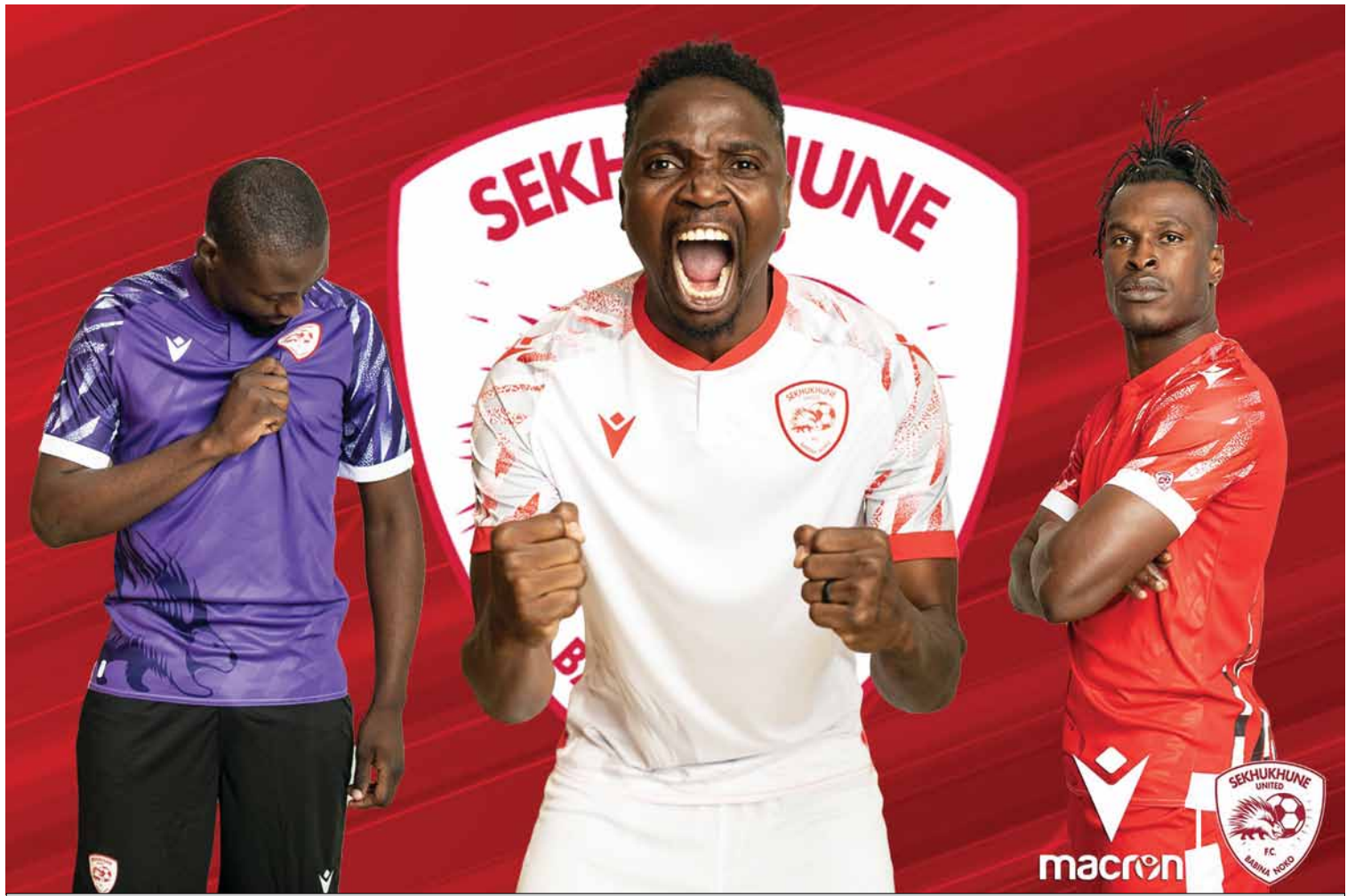
Sekhukhune United players showing off the new home and away kits after agreeing on a new partnership with Italian sportswear, Macron.

EPL, La Liga, Serie A league and many more, Macron has been eager to find a club in SA that has the same drive and values as us, and we have found it in Sekhukhune FC. We are very excited about this partnership. The team